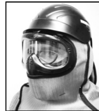
Fig. 2 – FX ® 9003 (Black) with Revision RX lens insert

The mask provides face protection but still allows the user to communicate during exercises. : This mask comes with a double fog-resistant lens on the interior of the lens assembly. This fog-resistant lens is made from moisture-absorbing polymer and is more susceptible to scratching. If persistent fogging of the visor occurs during the training, use the Simunition ® approved antifog dry cloth (Part number 8972090SP). See instruction on the back of the box. Note : All other antifog solutions may damage the lens.