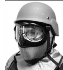
Fig. 1 – FX ® 9003 (Tan) with ESS lens insert

For use in FX ® interactive training with 9 mm, .38 cal. or 5.56 mm Simunition ® FX ® Marking cartridges only. DO NOT USE WITH ANY OTHER TYPE OR CALIBER OF AMMUNITION.