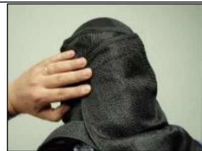
Fig. 5a – Hook and loop attachment of your FX® 9003 Protective Mask