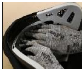
Fig. 18b - Goggle Assembly into the Mask's plastic shell