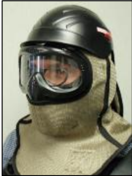
FX ® 9003 Protective Mask