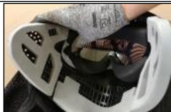
Fig. 18c - Goggle Assembly into the Mask's plastic shell