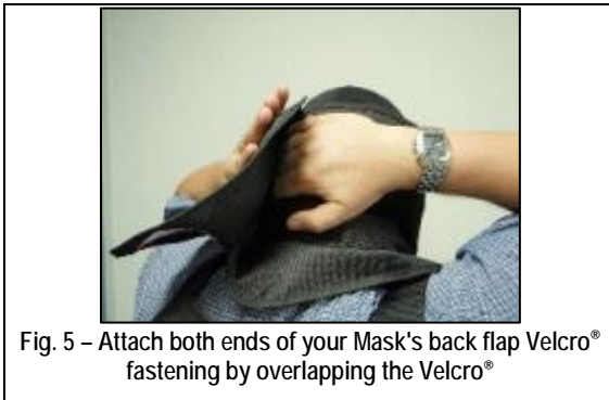
Fig. 5 – Attach both ends of your Mask's back flap Velcro® fastening by overlapping the Velcro®