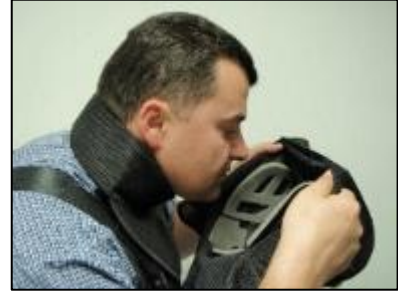
Fig. 4 – Place your chin first into the mask FX® 9003