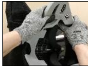
Fig. 17a – Insertion in the second lower (left) corner