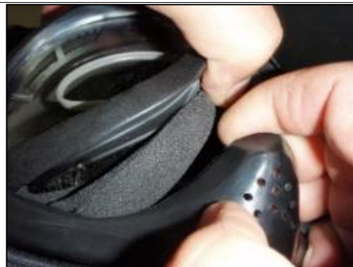
Fig. 14a - Nose portion of the mask's plastic shell

Note: Prior to reinstalling a Goggle Assembly; make sure there is no dirt inside the location where the Goggle Assembly will be installed.