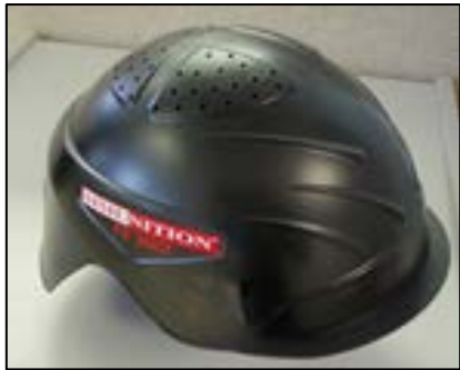
Fig. 7 - Hard top cover