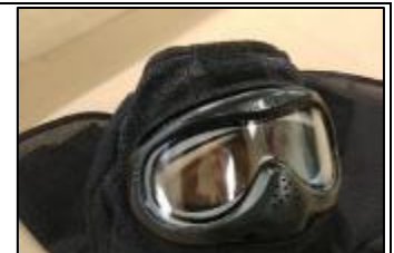
Fig. 18d - Goggle Assembly into the Mask's plastic shell