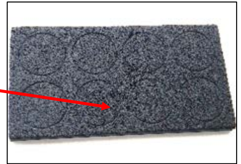
Fig. 9 - Self-adhesive foam