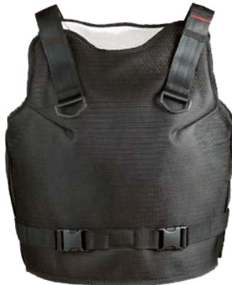
MALE : 8971830 FEMALE : 8971835

Providing outstanding torso protection, the FX ® 9000 vest is produced from high-strength textile. Resistant to wear and tear. Two models: male and female (extra chest padding). Available in black.