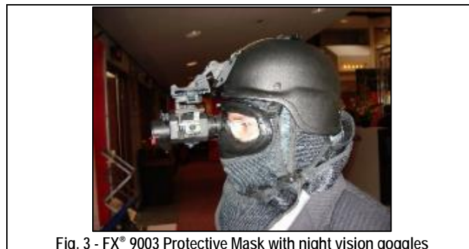
Fig. 3 - FX ® 9003 Protective Mask with night vision goggles