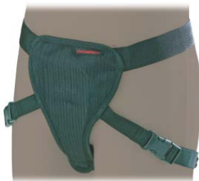
FEMALE : 8971771