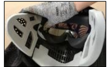
Fig. 17b - Insertion in the second lower (left) corner

Note: Some physical effort may be necessary to completely lodge the Goggle Assembly in the Mask.