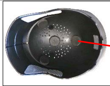
Fig. 8 - Hard top cover, inside view