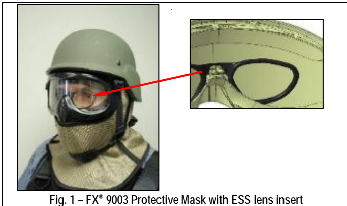
Fig. 1 - FX ® 9003 Protective Mask with ESS lens insert

The FX ® 9003 Protective Mask provides proper cheek weld for target acquisition and is compatible with most night vision goggles (NVG) and users helmets mounts (see figure 3).