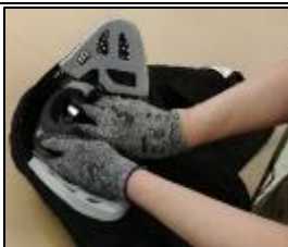
Fig. 18a - Goggle Assembly into the Mask's plastic shell