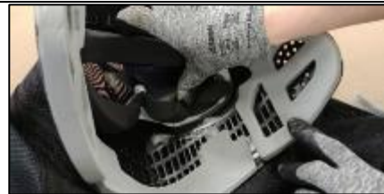
Fig. 16 - Mask's plastic goggle shell lower cavity