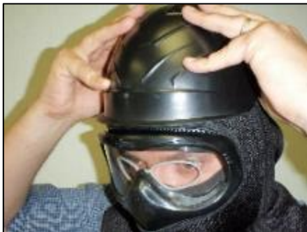
Fig. 11 - Hard Top Cover flipping