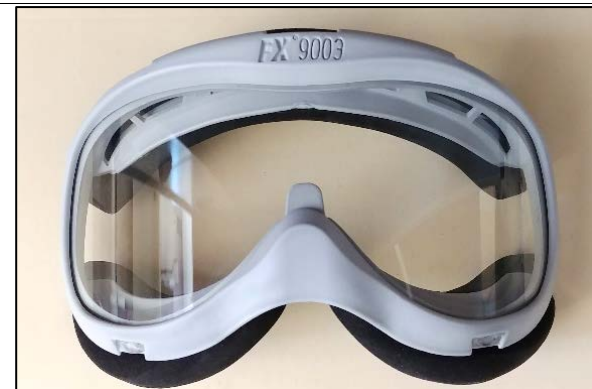
Fig. 13 - Goggle Assembly