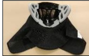
Fig. 15 - Mask's plastic shell