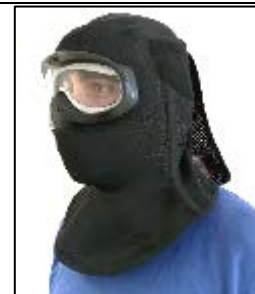
Fig. 6 – Adjusting the mask's textile

Note: The FX® 9003 protective mask must be worn with FX® Throat (8971764) and FX® groin protector (8971770-Male or 8971771-Female). These items are not included with the FX® 9003 protective mask.