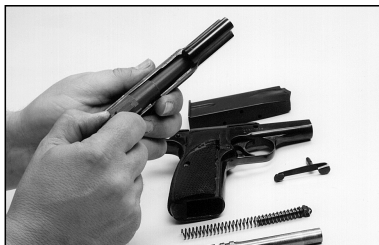
Fig. III Barrel slide assembly