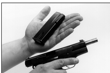
Fig. II Pistol handling prior to disassembly