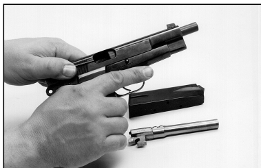
Fig. IV Pistol cycling