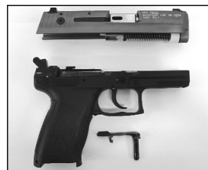
Fig. IV Disassembled pistol ready for conversion