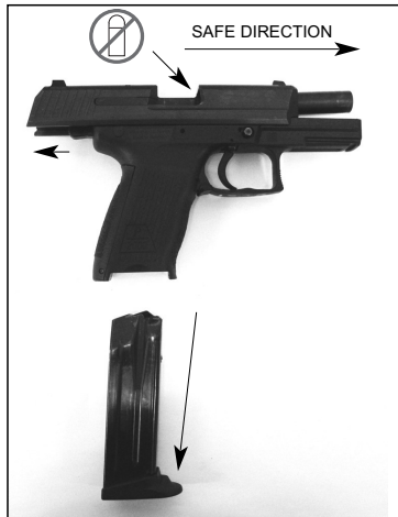
Fig. III Pistol handling prior to disassembly